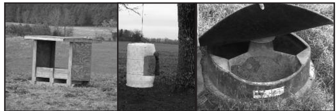
Examples of mineral and vitamin supplement feeder designs.

Many different mineral and vitamin supplement feeder designs are available. Examples are shown below. Consider differences in protection of the supplement from the environment, quantity of supplement the feeder can contain, ease of moving the feeder, and feeder durability. Strategic placement and positioning of open-sided mineral and vitamin supplement feeders can lessen weather effects on the supplement. For illustration, if precipitation most often falls and blows from one direction, then turning open sides of mineral and vitamin supplement feeders away from this direction is warranted.