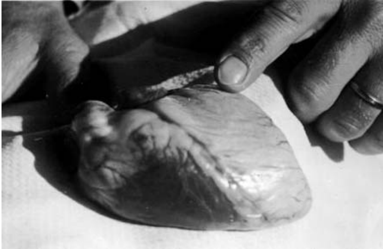
Figure 1.--Calf heart severely damaged by "white muscle disease." Note the light color of the affected ventricle. This animal died spontaneously from heart failure.