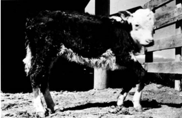
Figure 2.--Calf showing difficulty using forelegs, a characteristic of white muscle disease. This problem can be prevented or corrected by careful administration of selenium.